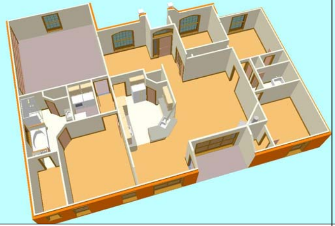
Cross Section 3